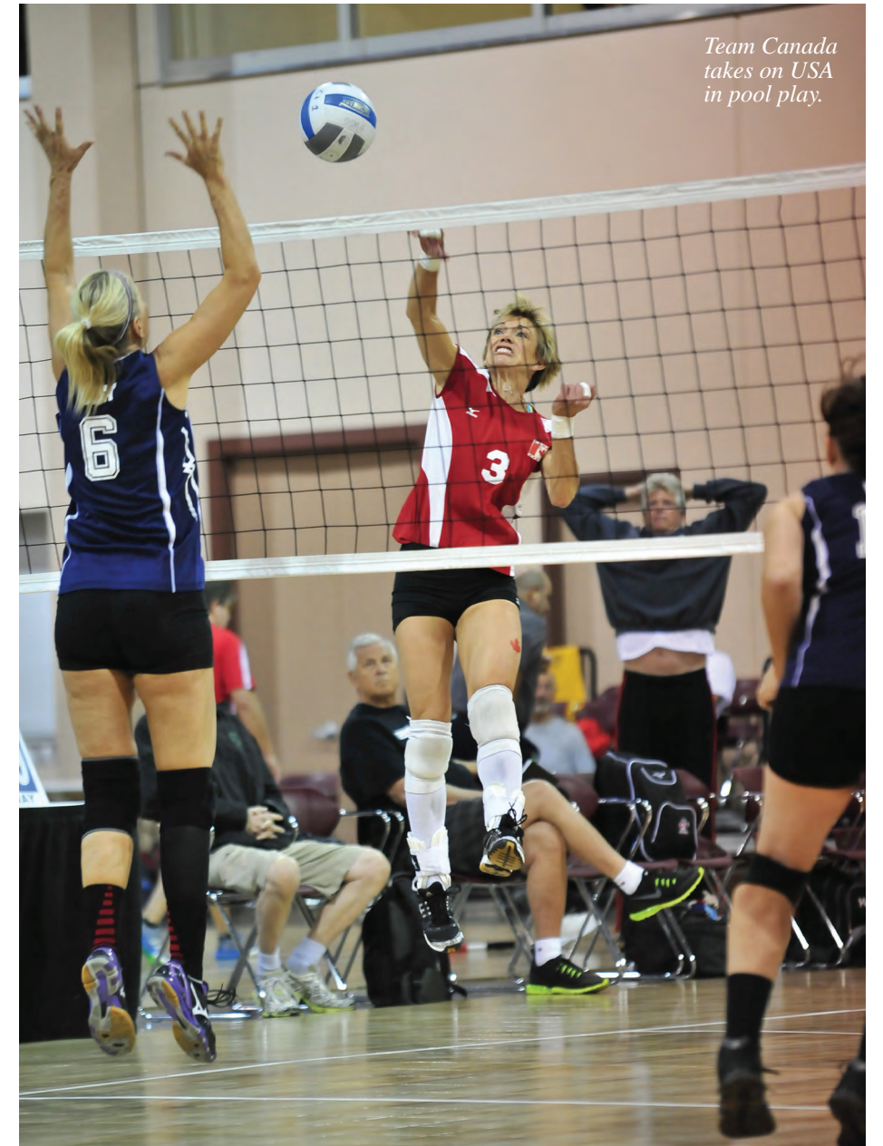
Team Canada takes on USA in pool play.