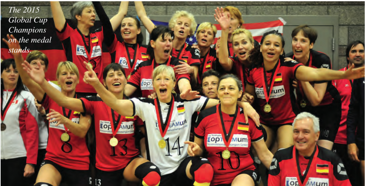
The 2015 Global Cup Champions on the medal stands.

Remember, teams will be accepted on a first-come-first-served basis – the first twelve (12) teams to return the Team Registration Form with deposit are guaranteed entry in the 2017 Global Cup World Senior Volleyball Championship Tournament. The following teams will receive this initial invitation: Australia, Brazil, Canada, China, Finland, Germany, Italy, Japan, Latvia, Russia, Switzerland, Ukraine, United States of America and Venezuela.