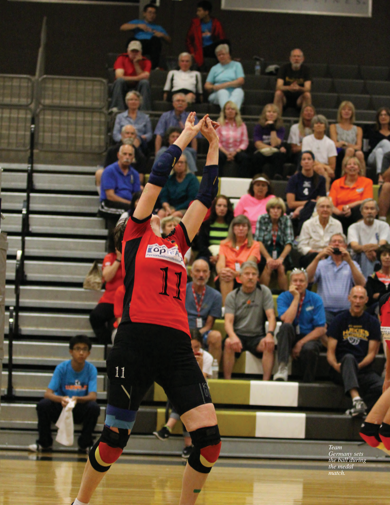
Team Germany sets the ball during the medal match.