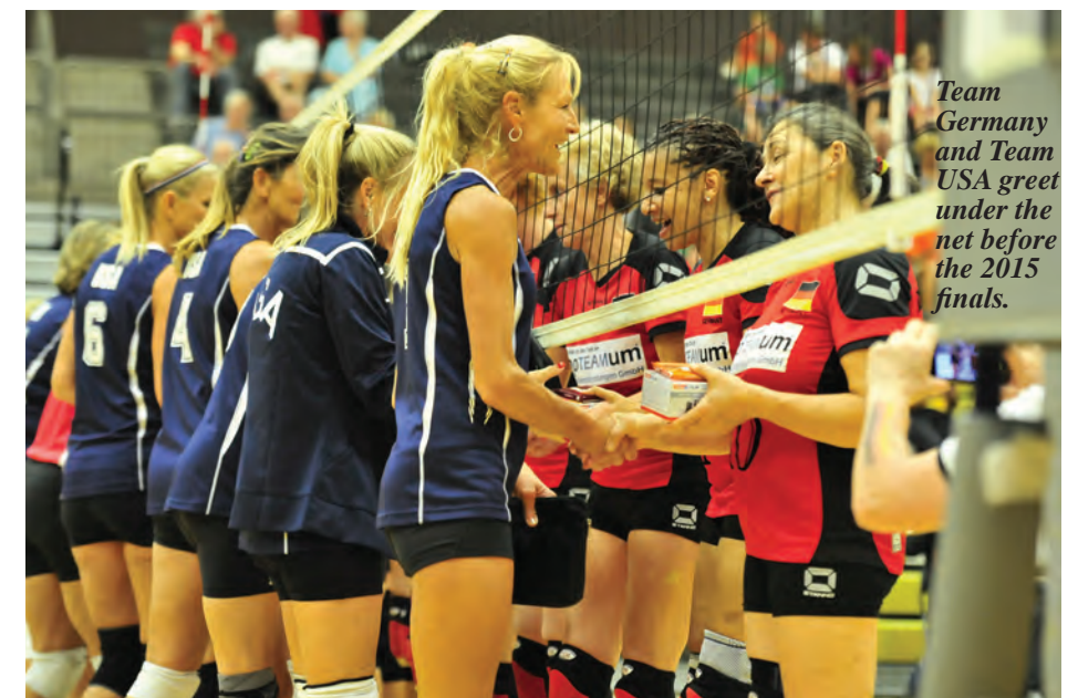
Team Germany and Team USA greet under the net before the 2015 finals.