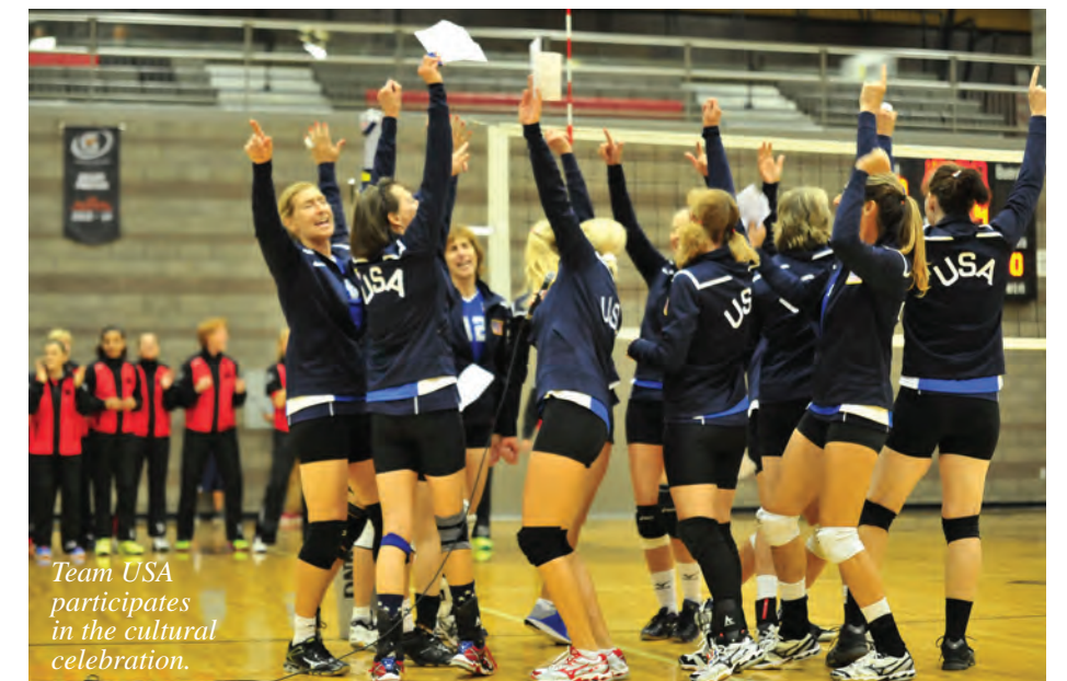
Team USA participates in the cultural celebration.